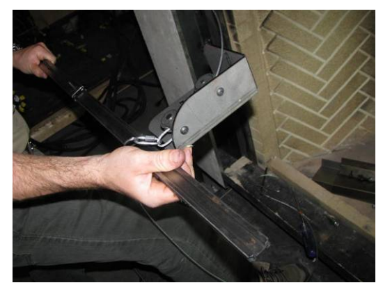
You can stop here if you want to change a counterweight cable.